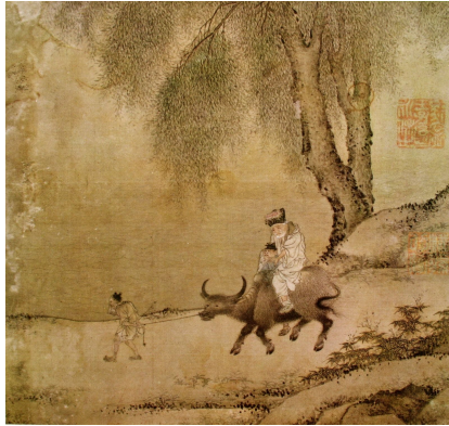
Li T'ang, Old Man and Child on Buffalo ca. 1100, ink on silk Freer Gallery of Art, Washington D.C., USA